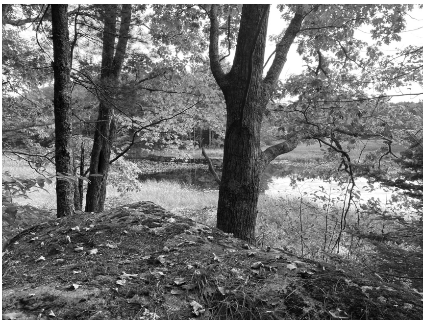
A view of the Pemaquid River from the new trail at Keyes Woods Preserve.

We welcome your comments and questions! Contact us at 207-563-1393 or info@coastalrivers.org .